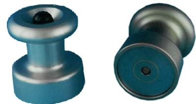
Sample holders, magnetic (round)