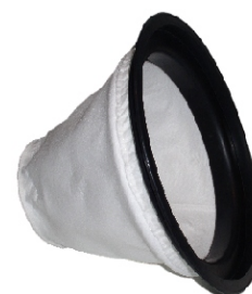
Exhauster motor protection

disc grinder HK350 for steel samples in combination with pendulum grinder HK150