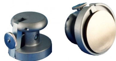
Sample holders, mechanical (round)